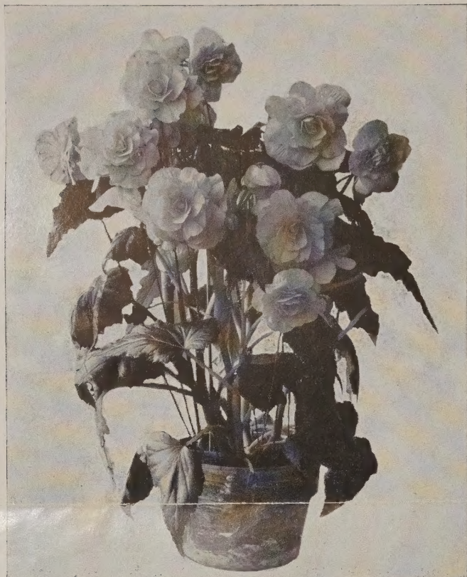
TUBEROUS BEGONIA - GIANT CAMELLIA FLOWERED